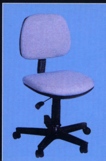
CD03 灰办公椅 Grey Office Chair