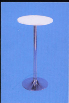
TB19 高圆桌 High Round Table (D)600x(h)1100mm