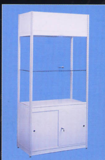
DP03 高饰柜 Tall Showcase Built-in with 2 Downlights (l)1000x(w)500x(h)2200mm