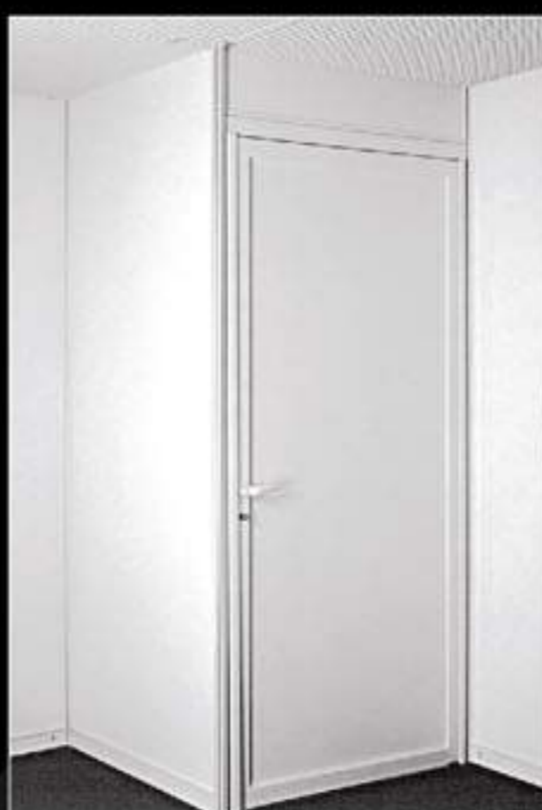
MS03 锁门 Lockable Door (w)1000x(h)2000mm