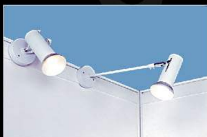
EL01 射灯 Spotlight (100W) EL02 长臂射灯 Longarm Spotlight (100W)