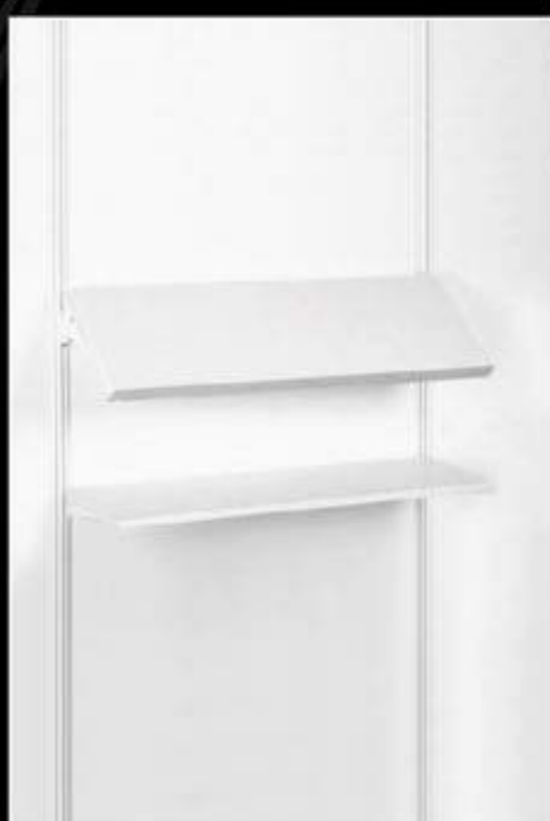
MS08 斜层板 Shelf (Flat) MS09 平层板 Shelf (Slope) (l)1000x(w)300mm