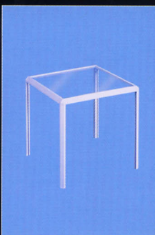
TB04 咖啡桌 Glass Coffee Table (l)450x(w)450x(h)450mm