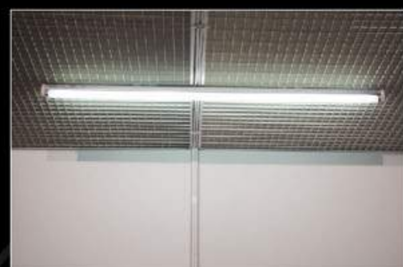
EL16 日光灯 Flu. Tube 40W

BEIJING SYMA EXHIBITION ENGINEERING CO., LTD. 北京华毅司马展览工程有限公司 NO. 188 Kangjiayuan, Jianguodonglu, Chaoyang District, Beijing 100025, P. R. China 北京市朝阳区建国东路康家园188号 邮编 100025 Tel (86) 10 6556 8330 Fax (86) 10 6556 8331 E-mail syma@public.gb.com.cn