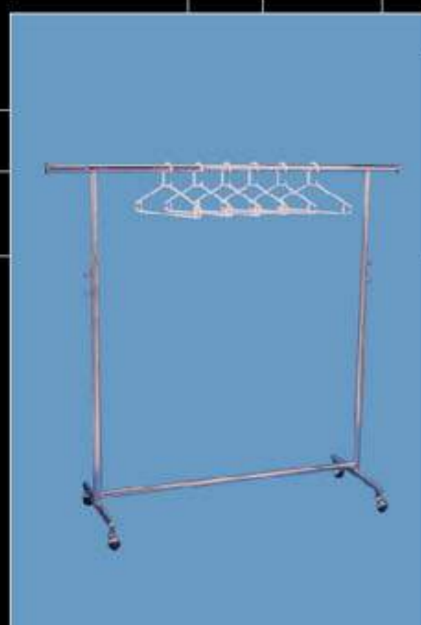
MS06 活动衣架 Movable Clothes Rack