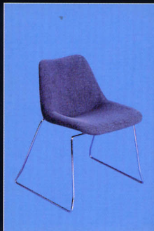
CD02 灰绒椅 Upholstered Chair