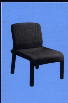
SD01 单座沙发 TM Single Seater Sofa Charcoal / Black Fabric