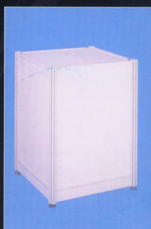
DP04 展示台 Display Cube (l)500x(w)500x(h)800mm (with various sizes)