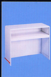
TB01 询问台 Information Counter (l)950x(w)450x(h)750mm