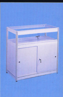
DP02 低饰柜 Table Showcase (l)1000x(w)500x(h)1000mm