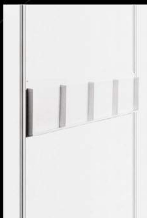
MS10 文件架 Literature Rack A4 Size