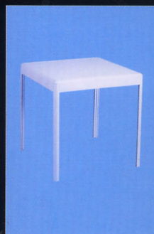
TB02 方桌 Square Table (l)750x(w)750x(h)750mm