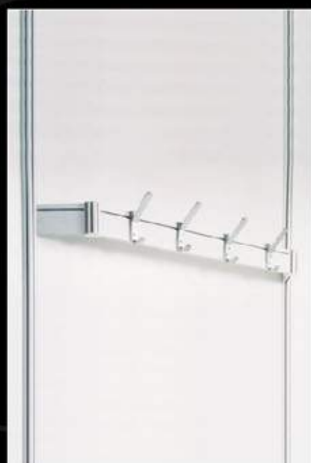
MS05 挂墙衣架 Coat Hanger