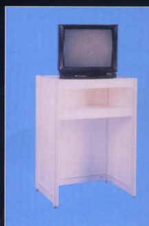
TB06 电视柜 TV Rack (l)700x(w)500x(h)1300mm