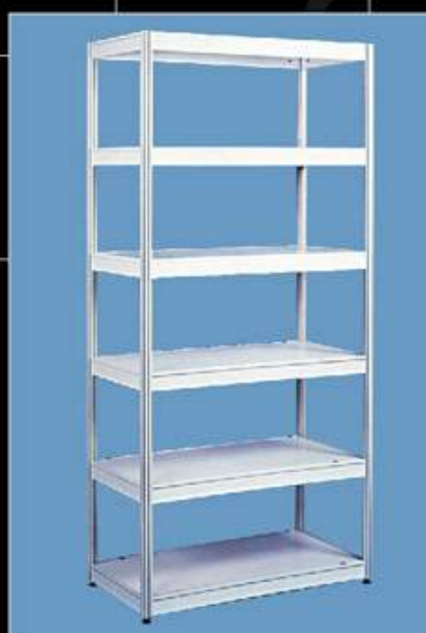
MS07 层板架 Shelf Rack (l)1000x(w)500x(h)2200mm