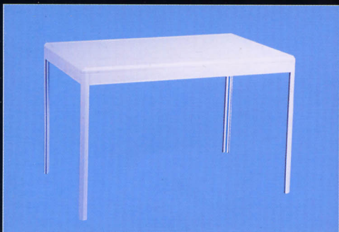
TB03 长方桌 Rectangular Table (l)1200x(w)750x(h)750mm