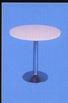
TB05 圆桌 Round Table (d)750x(h)750mm