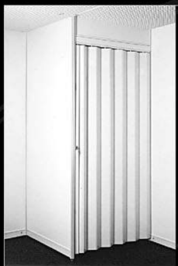
MS04 折门 Folding Door (w)1000x(h)2000mm