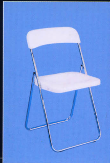
CD20 折椅 Folding Chair

additional components for rental furniture & equipment