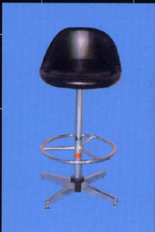
CD25 吧椅 Bar Stool