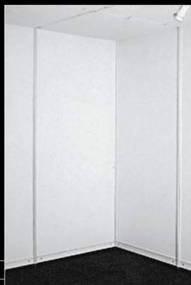
MS01 围板 Wall Panel (w)1000x(h)2500mm