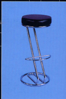
CD06 黑吧椅 Black Bar Stool