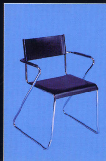
CD04 黑皮椅 Black Leather Chair