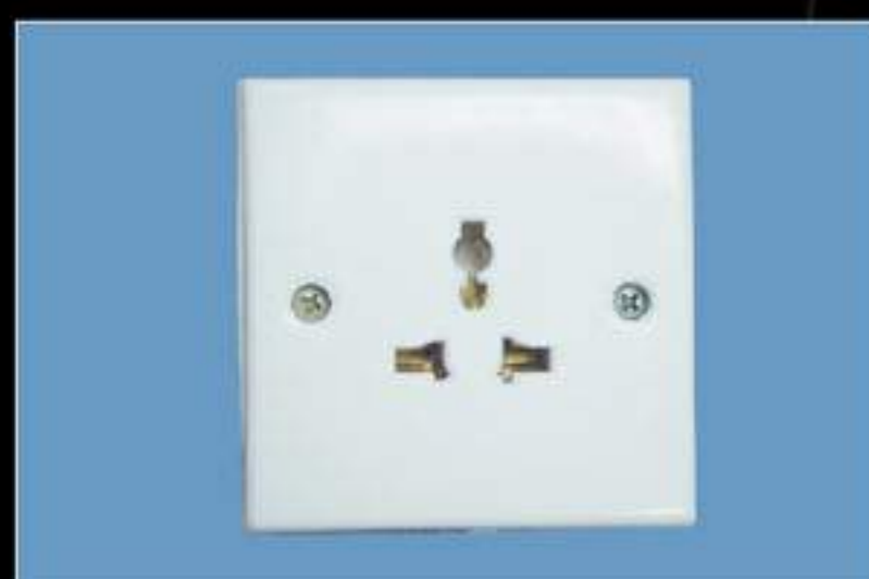
EM01 插座 Multi Plug 500W