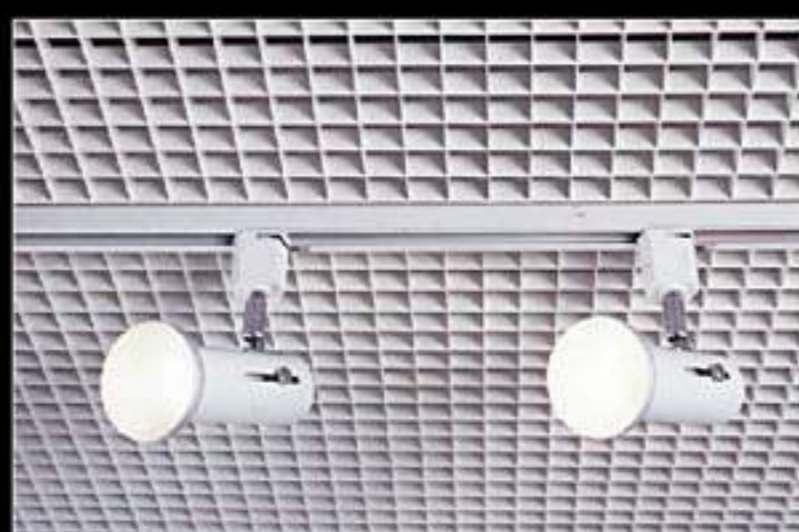
EL06 路轨灯 Tracklight 100W