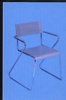
CD05 灰皮椅 Grey Leather Chair