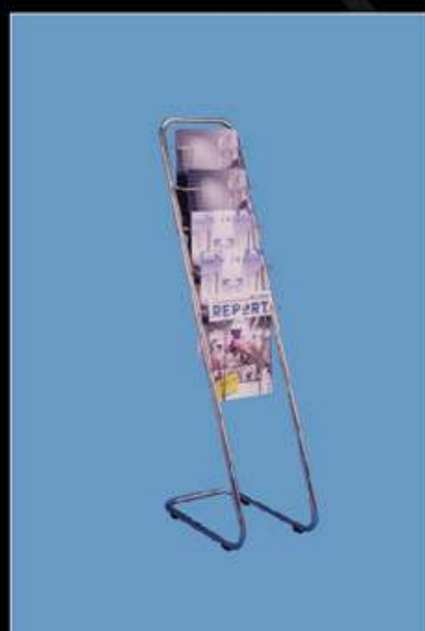
MS11 独立文件架 Free Standing Literature Rack