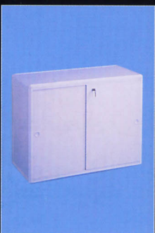
DP01 锁柜 Lockable Cupboard (l)950x(w)450x(h)750mm